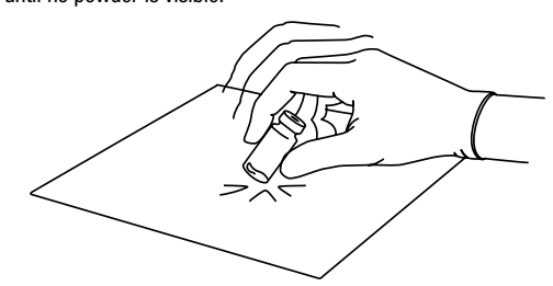
Figure 1: Tap firmly to mix.

Pad a hard surface to cushion impact (see Figure 1). Tap the vial firmly and repeatedly on the surface until no powder is visible.